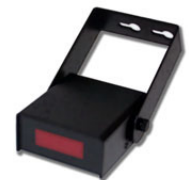
IR-RXC External IR Receiver

IR-RXC External IR Receiver, senses IR at 57 KHz (default) or 38 KHz, can be positioned for optimal IR reception, available for many iC-series controllers and tuners